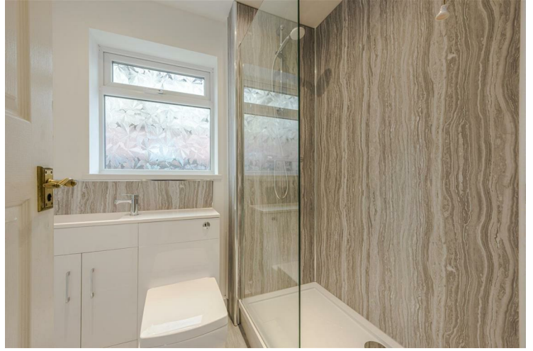
Bathroom 7'6" x 5'3" (2.31 x 1.62)