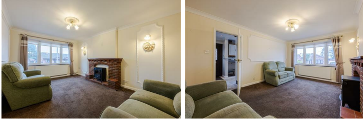
Lounge 16'7" x 10'8" (5.06 x 3.26)