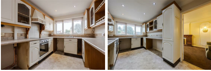
Kitchen 14'0" x 11'2" (4.28 x 3.42)